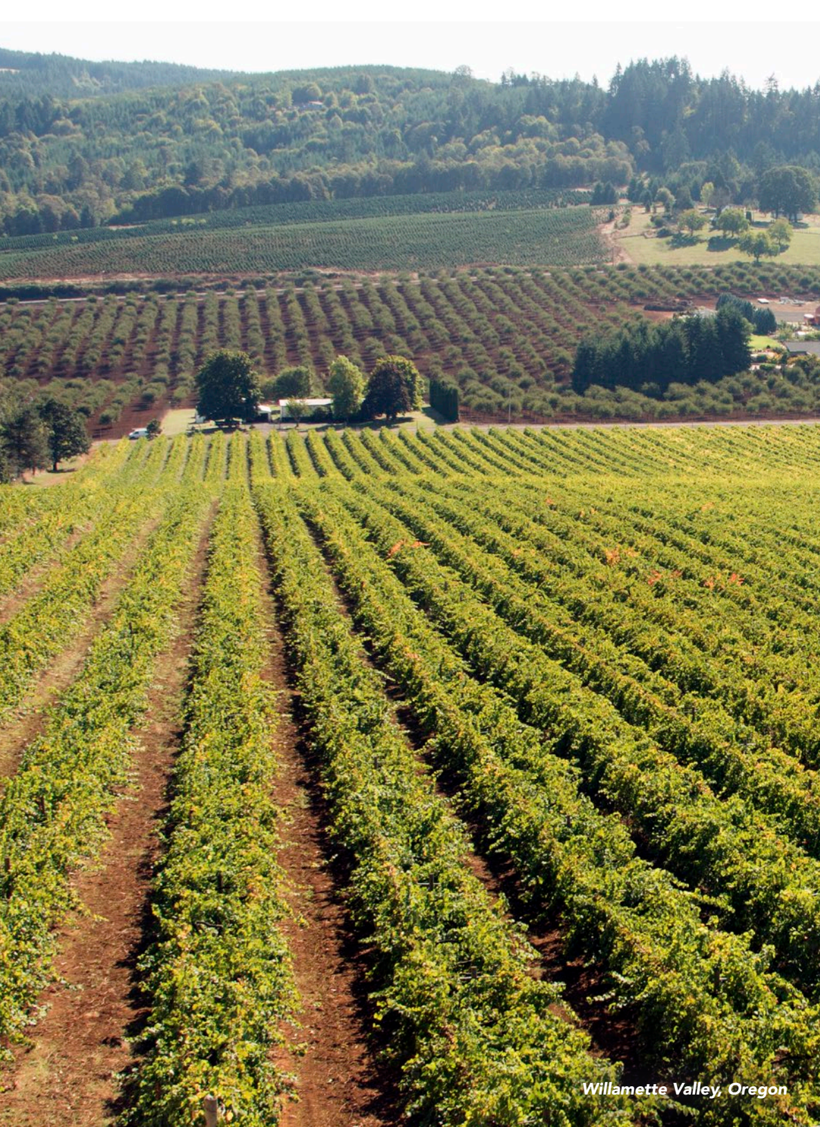
Willamette Valley, Oregon