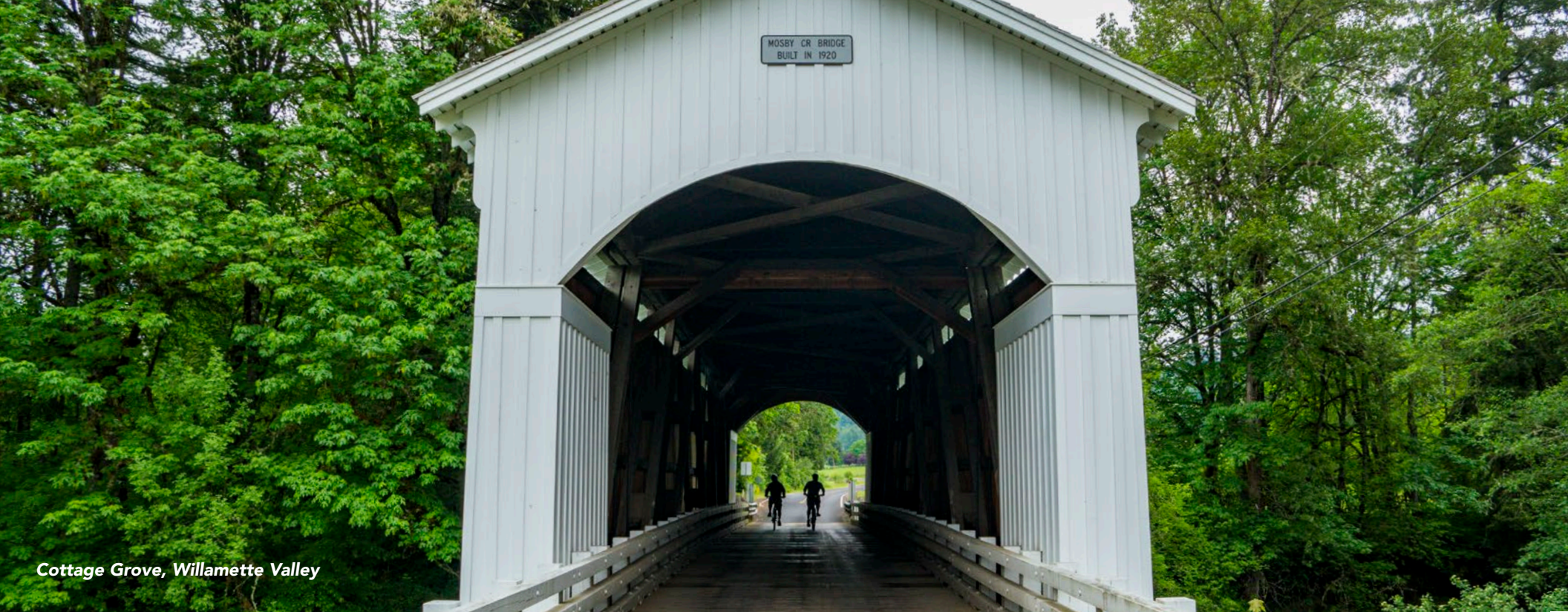
Cottage Grove, Willamette Valley